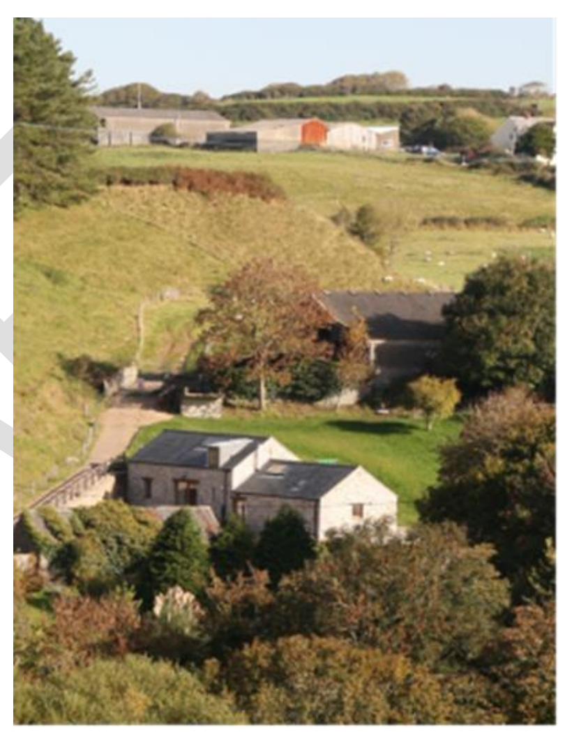
Above : Area of countryside with converted barns, Cheriton.

The policy sets out a range of policy criteria that proposals need to address in order to be considered suitable. Section 3 of this Guidance provides further information to confirm how the criteria will be applied as part of determining whether a building is suitable for conversion.