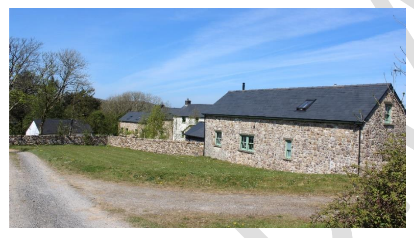
Above: Converted Farm Building, Gower

1.11 This SPG is intended to inform decision making on proposals within the countryside specifically. The LDP defines countryside as 'all the land that lies outside the defined settlement boundaries of the main urban area and Key Villages, as identified on the Proposals Map' (Swansea LDP paragraph 2.10.11). Any land in the County of Swansea that is outside the defined settlements (i.e. the urban area and Key Villages) is, by definition, countryside.