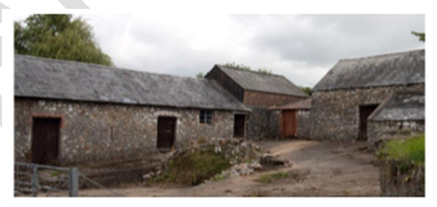
Above : A photograph of a group of farm buildings suitable for conversion

3.26 A primary factor in assessing proposals for conversion will be that the original character, structure and architectural integrity of the building and its setting should be respected, and ultimately the original character enhanced, by the conversion. If necessary, the needs of the user should be adapted to suit the building, rather than the requirements of the conversion being imposed upon it.