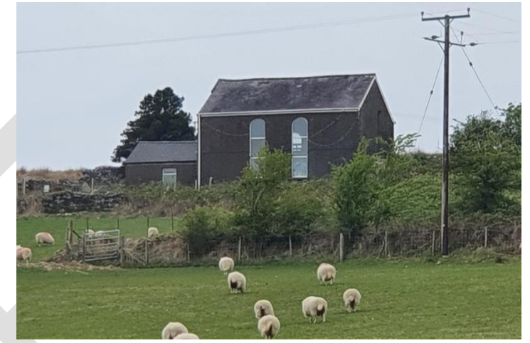
Above: Example of a traditional rural building, former Gerazim Chapel, Felindre

3.5 These examples listed in the policy serve to highlight the type of buildings that will be considered traditional, but it is important to note that this is not an exhaustive list. Throughout the countryside of Swansea there are other rural buildings that would require highly sympathetic conversion schemes to ensure they continued to create locally distinctive development. Redundant agricultural buildings are for example one of the most common building types to be converted.