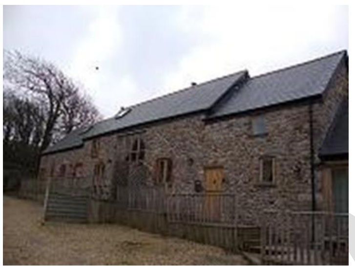
Above: Conversion of former barns, Church Barns, Llanmadoc